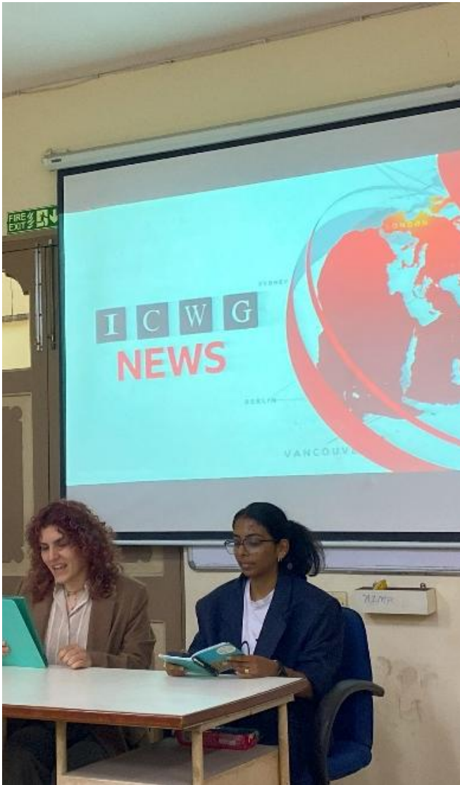
Experiences of students (2024-25)

The final project turned out to be a stimulating and enriching experience , both for the depth of the topics addressed and for the continuous exchange between students and professors from different disciplines. Additionally it was particularly interesting to observe how different groups tackled similar themes using diverse and relative approaches . Likewise, it was highly educational to understand how these topics were similarly connected to the social, cultural and political dynamics of the four countries represented by the participating students.