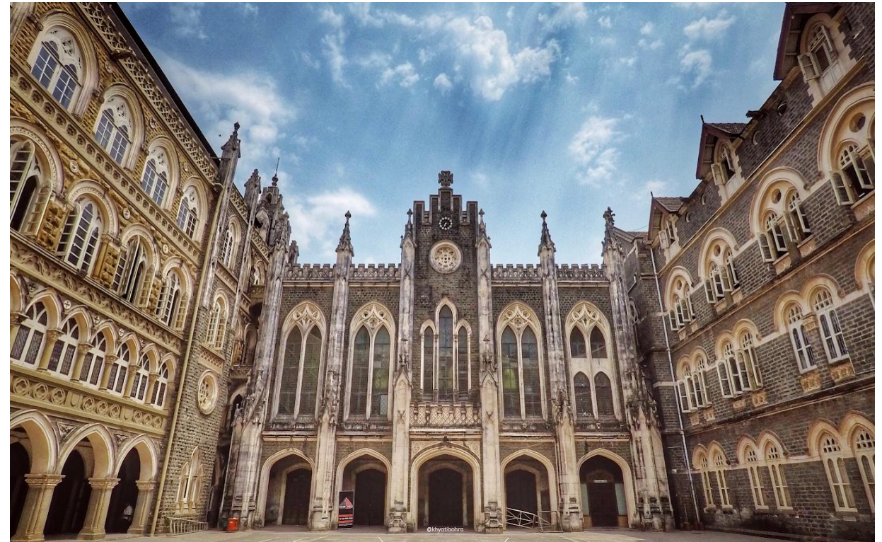
St. Xavier's College (Mumbai)

it is necessary to attend both activities